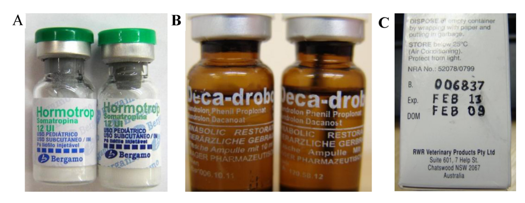
Fig. 3. (A) Original (left) and a fake (right) Hormotrop<sup>®</sup> flask, showing significant differences in the printing quality of the labels. (B) Fake Deca-drobol<sup>®</sup> flasks, with misspellings (Dacanoat instead of Decanoat, Proplonat instead of Propionat). (C) Stanazol<sup>®</sup> package with erasured label.

example, the product Hemogenin<sup>®</sup> was fraudulently commercialized under manufacturer names such as "Sarsa" with the appearance of the previous version of the original product (Fig. 2). Package analysis allowed the identification of 54 counterfeits among the 858 products that were not chemically analyzed, and which were replicas of an original product (and therefore could not be classified as "inexistent manufacturer"). Some examples are shown in Fig. 3.